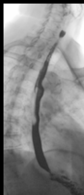
CombiDiagnost R90 Fluoroscopy grab Detector dose: 41 nGy