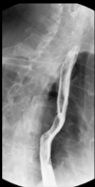
Previous system Series Exposure Detector dose: 660 nGy