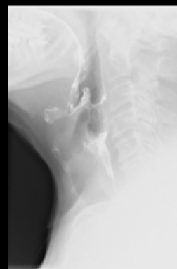
Previous system Series Exposure Detector dose: 810 nGy