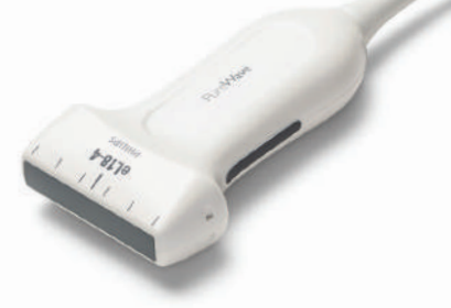
The Philips eL18-4 PureWave linear array transducer is our first high-performance transducer featuring ultra-broadband PureWave crystal technology with multi-row array configuration, allowing for fine-elevation focusing capability.

Utilizing the eL18-4 linear array transducer, MicroFlow Imaging (MFI) was used to further interrogate the renal cortex throughout the kidney. This demonstrated normal perfusion in the both poles but clear areas of cortical infarction between the equatorial region and upper pole.