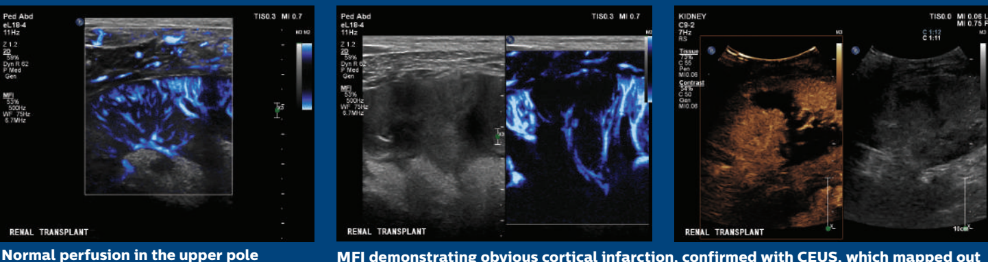
MFI demonstrating obvious cortical infarction, confirmed with CEUS, which mapped out the overall extent of the defect

as suspected on MFI. We estimate the total volume of renal infarct to be in the order of 10-15% of total renal volume – a useful prognostic indicator of subsequent renal function (Stenberg et al., 2017).